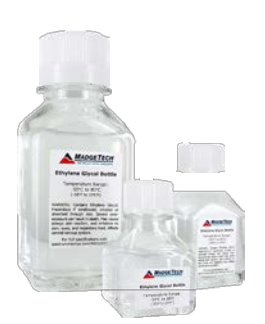
Ethylene glycol bottle (optional)